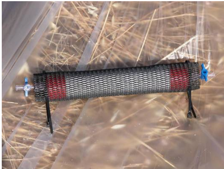
FIGURE 2.2 STANDARD RPPS NO-PURGE SAMPLER DEMONSTRATION MCCLELLAN AFB, CALIFORNIA