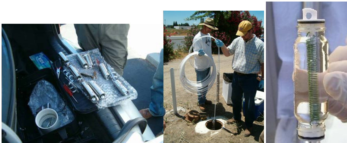
FIGURE 2.5 STANDARD SNAP SAMPLER™ NO-PURGE SAMPLER DEMONSTRATION MCCLELLAN AFB, CALIFORNIA

Up to three Snap Samplers™ can be connected in series with a single suspension/trigger cable. The suspension/trigger cable consists of a 1/32-inch-diameter stainless steel wire rope within ¼-inch HDPE tubing. The HDPE tubing attaches to the samplers and the wire rope attaches to the release mechanism of the sampler. The samplers are lowered into the well to a predetermined depth using the suspension/trigger cable. The suspension/trigger cable is secured at the surface at a well-head docking station that does not interfere with well-head locks or water level measuring devices.