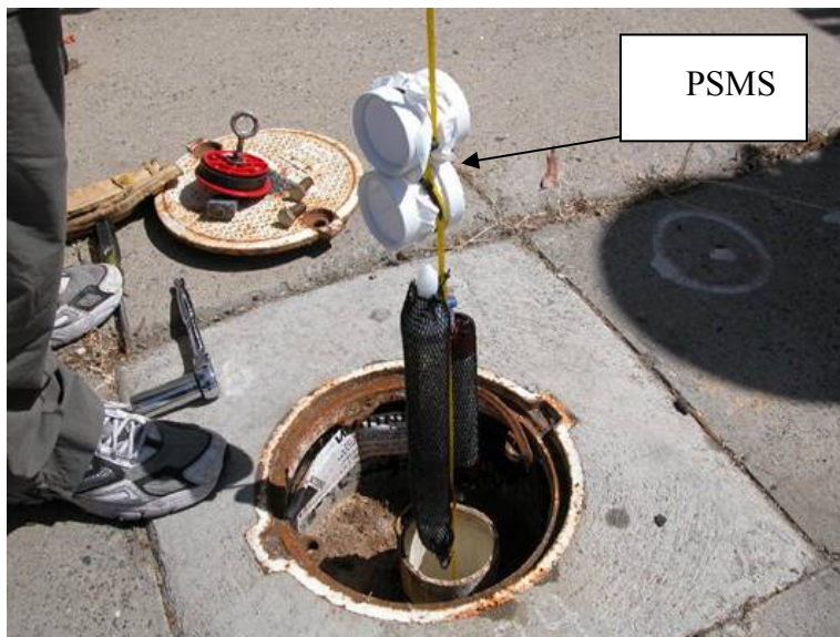
FIGURE 2.3 STANDARD PSMS NO-PURGE SAMPLER DEMONSTRATION MCCLELLAN AFB, CALIFORNIA

membrane was positioned orthogonally to horizontal groundwater flow. Due to the lack of field- or bench-scale testing of PsMSs, potential advantages or disadvantages of this sampler have not been quantified.