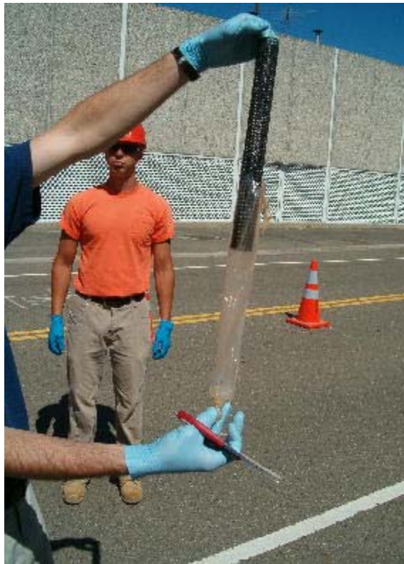
FIGURE 2.4 STANDARD RCS NO-PURGE SAMPLER DEMONSTRATION MCCLELLAN AFB, CALIFORNIA