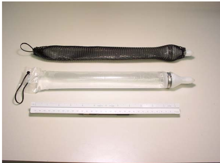
FIGURE 2.1 STANDARD PDBS NO-PURGE SAMPLER DEMONSTRATION MCCLELLAN AFB, CALIFORNIA

Depending on the hydrogeologic characteristics of the aquifer, the diffusion samplers can reach equilibrium within 3 to 4 days (Vroblesky, 2001). Groundwater samples collected using the diffusion samplers are thought to be representative of water present within the well during the previous 24 to 72 hours. However, the recommended minimum equilibration time for water temperatures above 10 degrees Celsius ( ^{\circ}\text{C} ) is two weeks (ITRC, 2004).